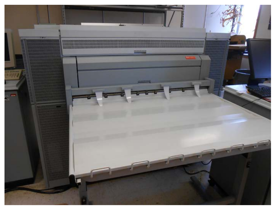
Front of Printer