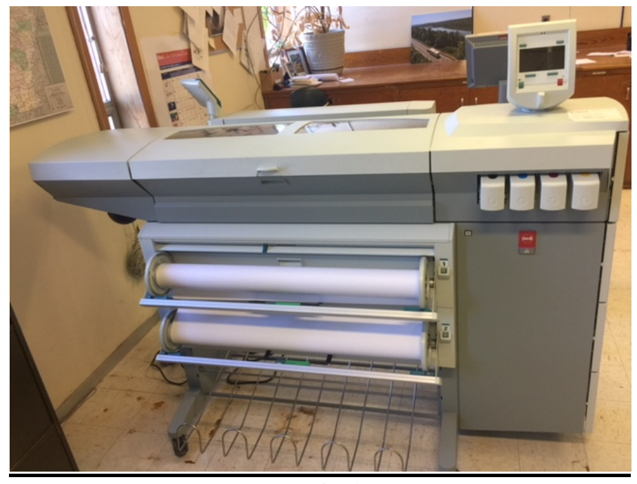
Front of Printer