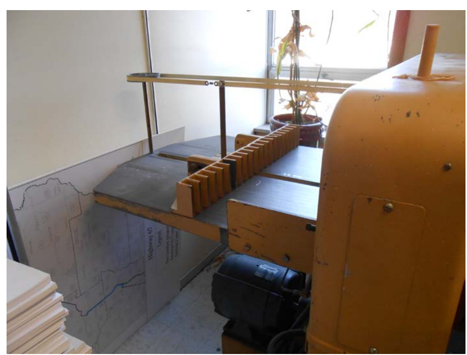
Back of Cutter