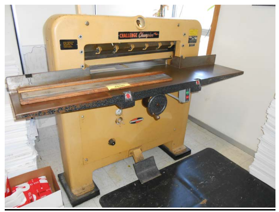
Front of Cutter