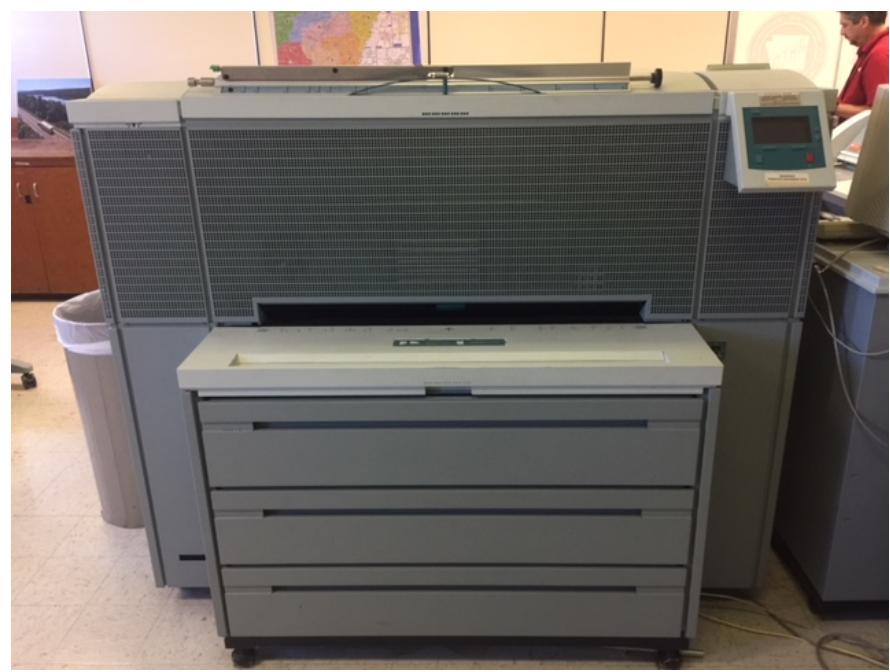
Back of Printer