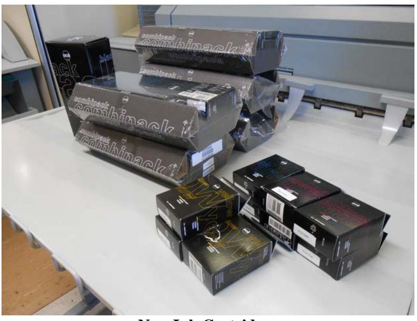
New Ink Cartridges