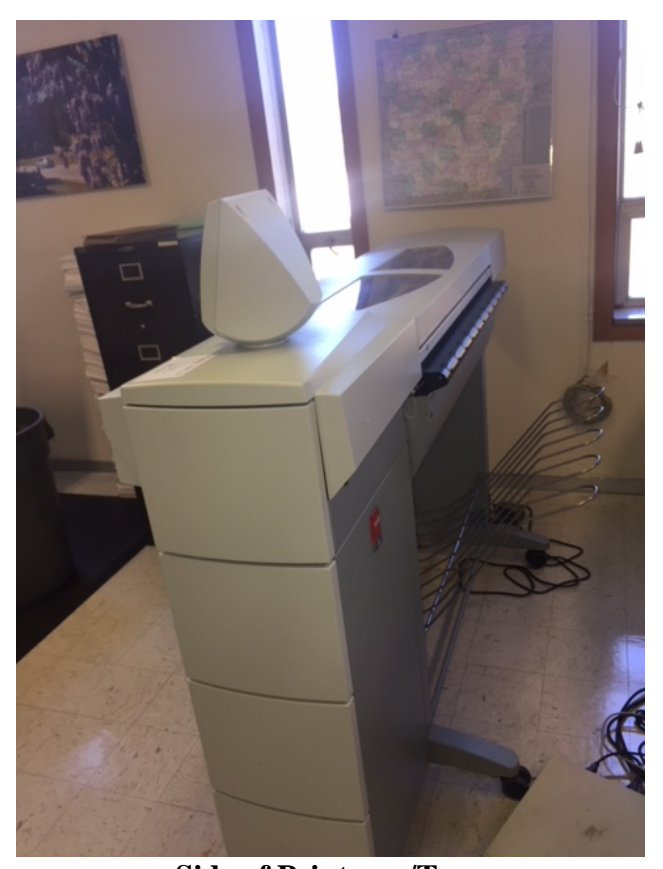
Side of Printer w/Tray