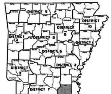
ARK. HWY. DIST. NO. 2