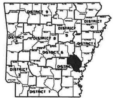
ARK. HWY. DIST. NO. 2