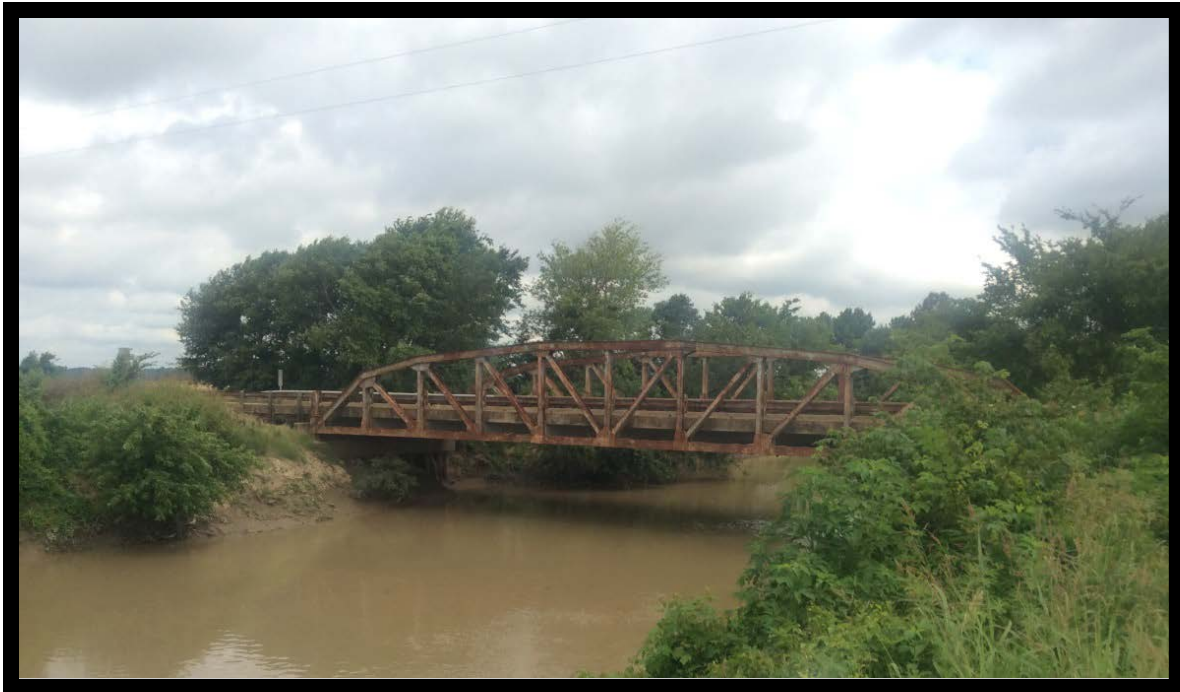
Figure 1: ARDOT Bridge Number M3187

ARDOT Bridge Number M3187, on State Highway 230, was determined eligible for inclusion in the National Register of Historic Places in 2017. The bridge displays the Parker pony truss design. The truss span is approximately 100 feet in length and 24 feet wide.