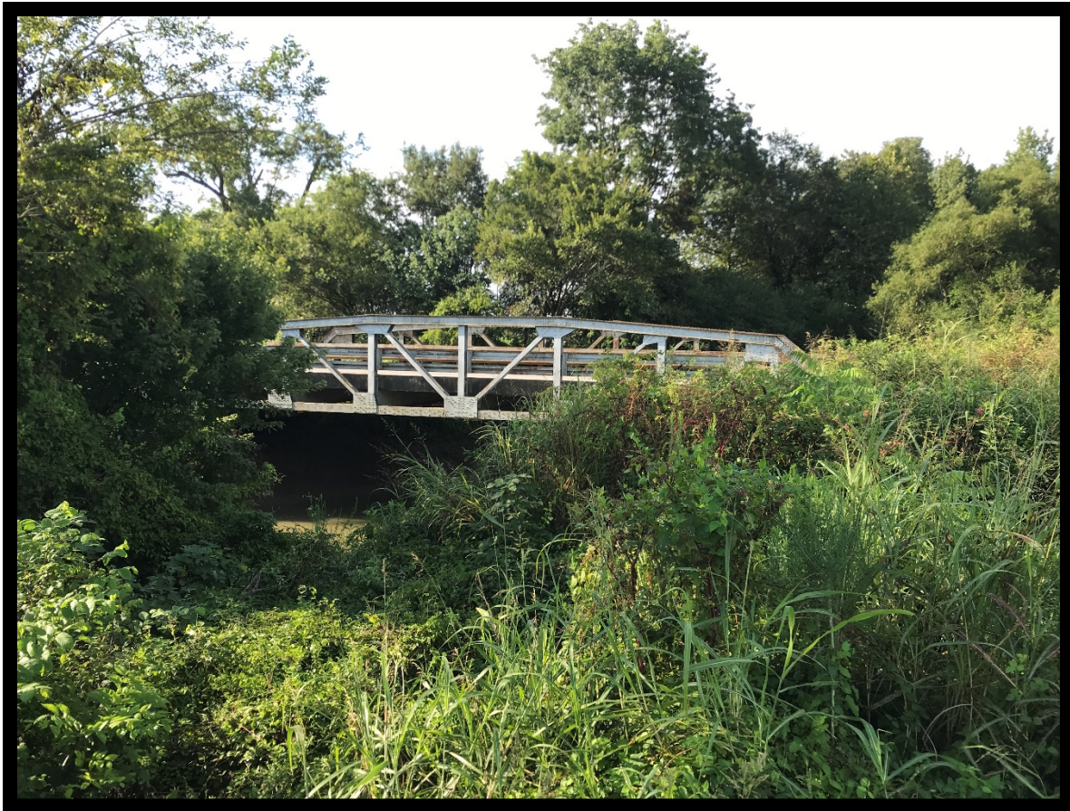
Figure 2: ARDOT Bridge Number M3817

ARDOT Bridge Number M3817, on State Highway 230, was determined eligible for inclusion in the National Register of Historic Places in 2020. The truss span is 82 feet long and 24 feet wide, and it was likely built using the Standard Plan for an 80' Low Truss Span (Drawing Number 2445).