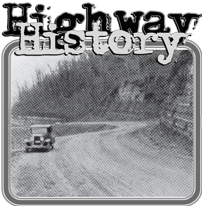
Highway 65 near Leslie in the 1920s.

Hobbies: I love traveling to see my children and grandchildren and spending time with them. I enjoy trying all the new painting techniques I see on HGTV, and wallpapering too. I enjoy working with friends that do some interior designing and floral arrangements. I play hand bells and sing in the choir at the First United Methodist Church in Hope. I also serve on the Administrative Board at church. I enjoy spending time with my friends and reading.