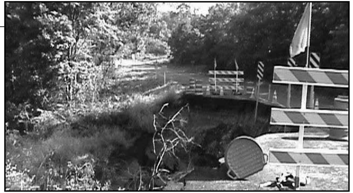
Slope damage to Highway 7 near Pelsor, where seven inches of rain associated with Hurricane Gustav fell.

Receding waters have allowed AHTD workers to assess any damage there may have been to roadways, culverts and