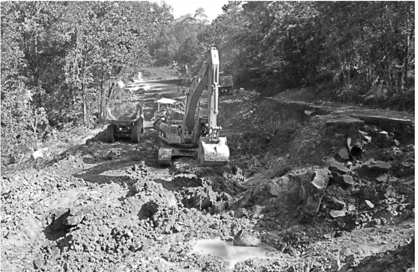
Work underway to repair Highway 7, south of Pelsor.

As if Gustav wasn't enough to deal with, Hurricane Ike followed in its footsteps just one week later. Ike entered the state as a tropical storm and deteriorated to a tropical depression just hours later. Though the storm cut power to over 275,000 Arkansans and spawned a few tornadoes, there were fewer reports of flooded highways with Ike. Flooding would have been worse had Ike not moved through the state so quickly.