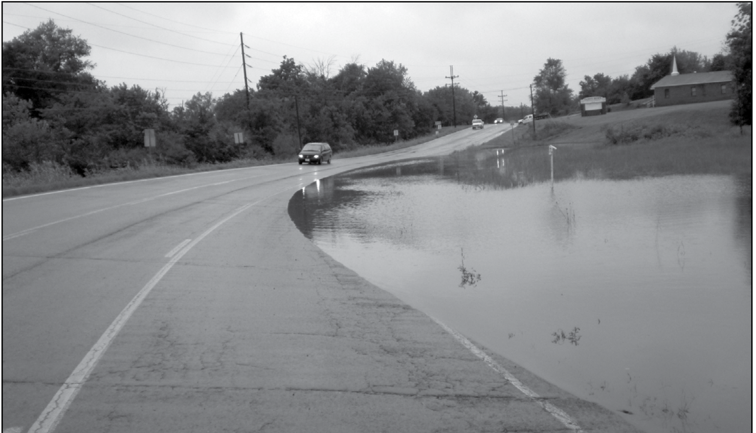
The northbound lane of Highway 71 at Mansfield is overtaken by rising water.

A section of Highway 7 near Pelsor, in Pope County, was closed to through traffic on September 4th due to slope damage. The same location suffered slope damage in March of this year when flooding left damaged highways in 32 counties. Crouse Construction Company of Harrison, Arkansas, was awarded a $492,948.72 contract in August to make repairs to Highway 7. (See FLOOD, Page 6)